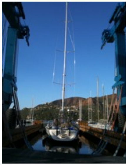
Kealoha awaits lift out from the 330 tonne crane Yacht

Engineers came on board and serviced the waste water treatment system. There were some adaptations completed while the vessel was out of the water concerning the pipe work.