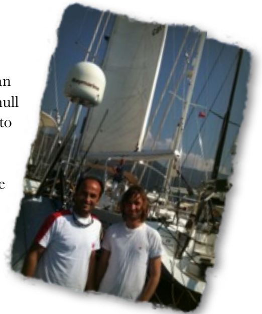
Above, the hard working Elvestrom Team, always smiling

unable to salvage Pinkie the spinnaker destroyed in Sardinia, racing, but we have two other spinnakers on board to enjoy.